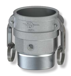
LONG B COUPLER PICTURED WITH PORT*